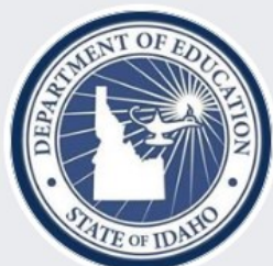
Idaho State Department of Education @IDSDE