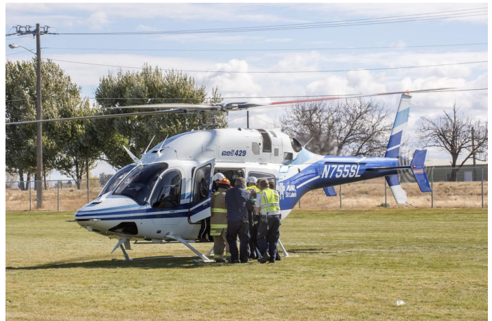
Air St. Luke's loads up an actor as first responders take part in a DUI reenactment Monday at Filer High School.