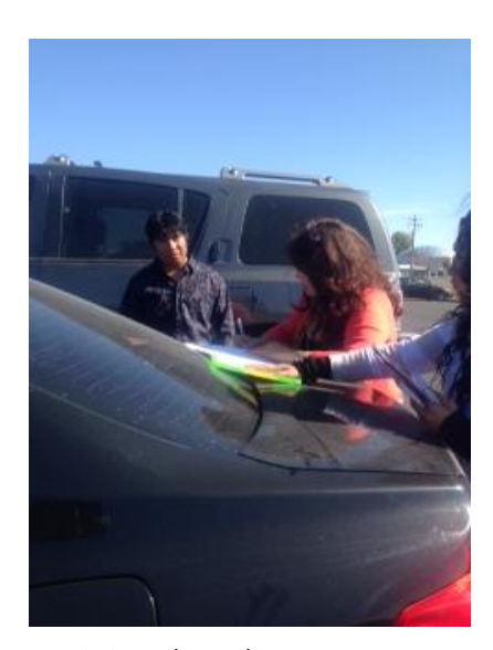
Going where the parents are.