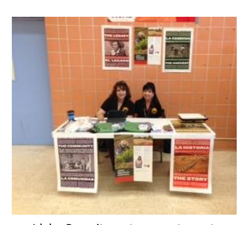
Idaho Recruiters at a parent event.

These goals are accomplished through three interactive components: 1) Recruiter Quality Controls; 2) Proper Eligibility Determinations and Documentation Submission Quality Controls; and 3) Rolling re-Interviewing with each component being of equal importance and each being implemented with fidelity to achieve high quality ID&R in the State of Idaho. For additional information on Idaho's Quality Control Process, visit <a href="http://www.sde.idaho.gov/el-migrant/migrant/index.html">http://www.sde.idaho.gov/el-migrant/migrant/index.html</a>.