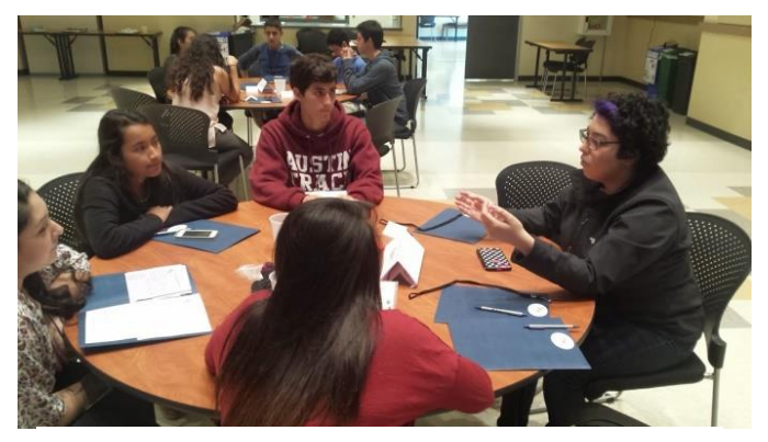
Meeting with students and visiting classrooms is an important (and fun) part of monitoring.

To monitor local MEPs, the Idaho State Department of Education uses a tool that is based on OME's Guidance for Monitoring Title I, Part C—Migrant Education. The State has taken this document and expanded it to contain the MPOs contained in this SDP report and a rubric that contains quality indicators on which the State can observe and gather evidence to go beyond determination of "in compliance" and "out-of-compliance". The Idaho MEP Monitoring tool is found on the State website at <a href="http://www.sde.idaho.gov/el-migrant/migrant/index.html">http://www.sde.idaho.gov/el-migrant/migrant/index.html</a>