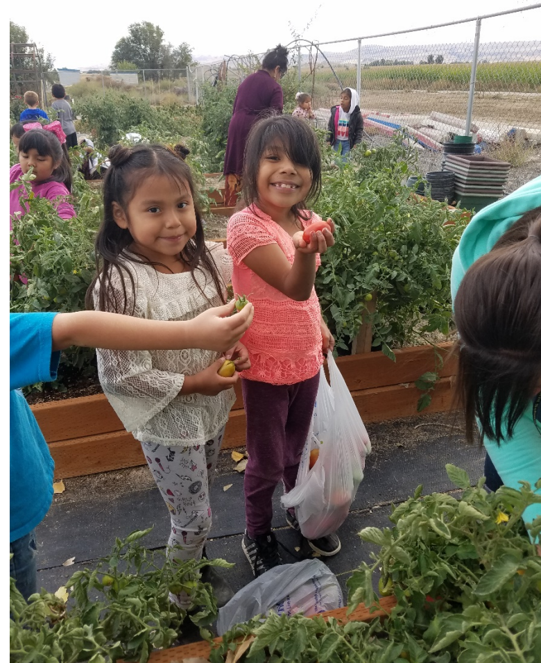
Marsing Elementary Afterschool Program