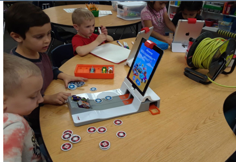
West Ada School District

Offer students a broad array of additional services, programs and activities. Activities such as youth development activities, service learning, nutrition and health education, drug and violence prevention programs, counseling programs, arts, music, physical fitness and wellness programs, technology education programs, financial literacy programs (ESSA, Sec. 4201(a)).