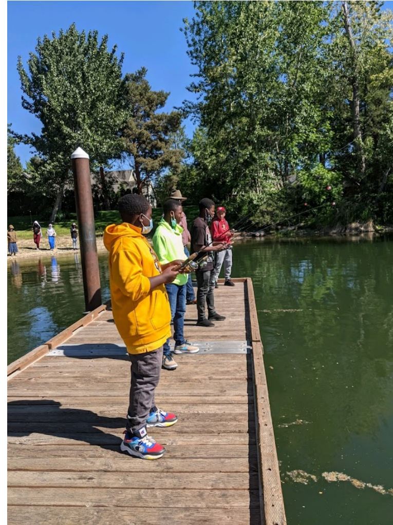
Boise School District

Provide opportunities for academic enrichment , including providing tutorial services to help students, particularly students who attend low-performing schools , to meet the challenging state academic standards (ESSA, Sec. 4201(a)).