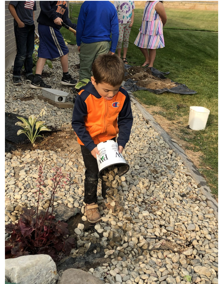
Hansen School District