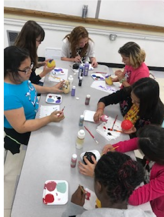
Parma School District Afterschool Program

Local educational agency, community-based organization, Indian tribe or tribal organization, a public or private entity, or a consortium of two or more such agencies, organizations, or entities (ESSA, Sec. 4203).