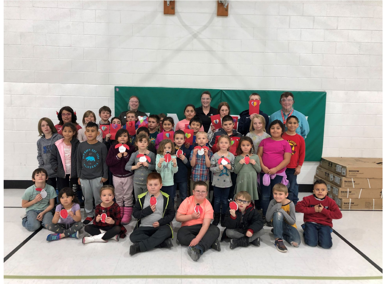
Hansen School District