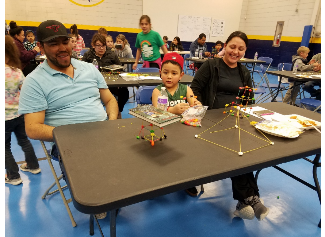
Marsing Early STEM Family Night

Offer families of students served by community learning centers opportunities for active and meaningful engagement in their children's education, including opportunities for literacy and related educational development (ESSA, Sec. 4201 (a)).