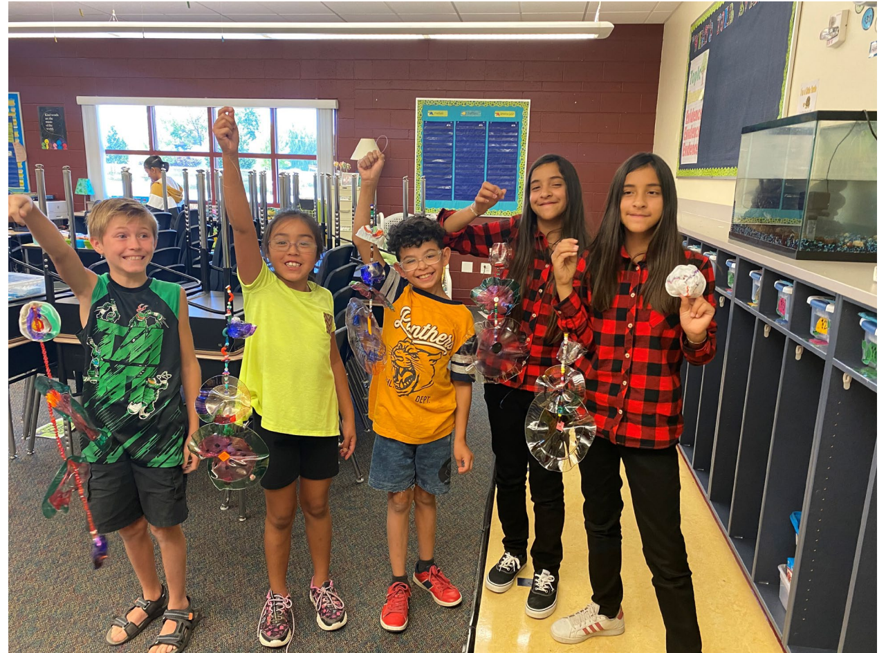
Wendell School District Afterschool Program